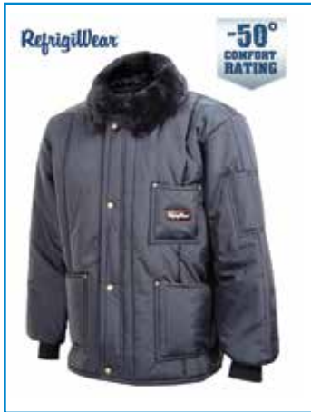
Cold Room Jackets

Signet Qatar offers the widest range of uniforms & safety apparels and accessories to hospital, hospitality & industrial sectors