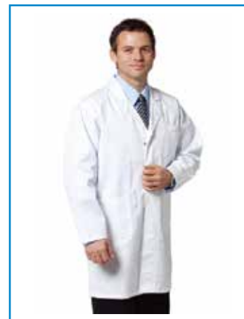
Lab & Doctors Coat